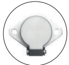
CH2F 20A charge / discharge socket supplied