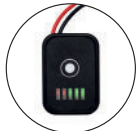
Fuel gauge supplied